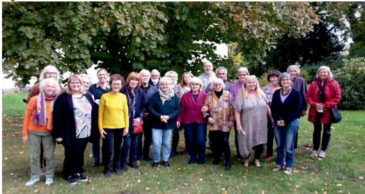
Annual CIF-meeting, October 16, 2021